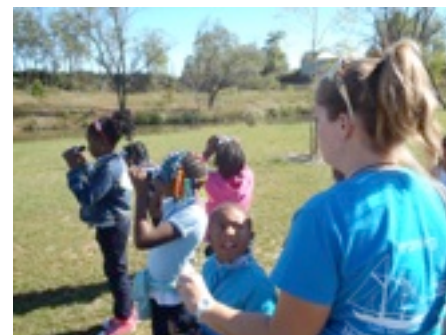
Students exploring nature at Masonville Cove

cold weather's arrival and fall's surrender to winter are reminders of those constant developments and changes, which, inevitably, will bring us a new year; a healthier, more familiar Masonville Cove; and a new variety of questions and adventures for us, our neighbors, and our students.