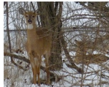
Scenes at Masonville Cove: Box turtle, the Brain, bathing in her indoor habitat; Ice-cover on the Cove and Sand Flat at mouth of outfall creek ; Creativity shined at Holiday ornament making program; Whitetail deer near outfall creek.