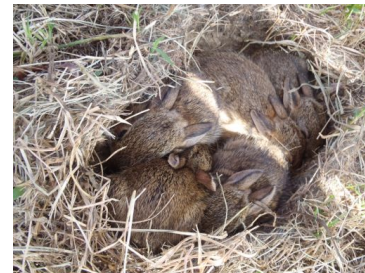
Scenes from Masonville Cove~Lt. Governor Anthony Brown addresses community trainees for Small Watershed Action Plan, a pair of deer bedding down along the MC creek, male pheasant in conservation area, a nest of baby bunnies.